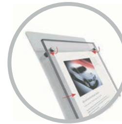
Secure upper fixings to the acrylic holder