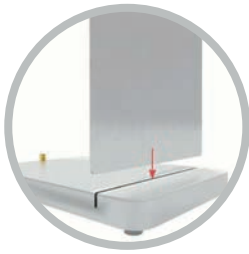
Fit alloy plate into base plate slot