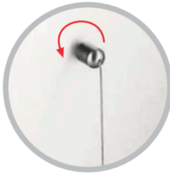
Screw the remaining cable connector to the connector thread fitted on rear of alloy plate