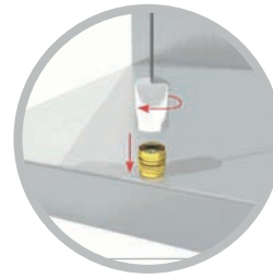
Fix the male connector on wire to the female connector thread fitted on base plate