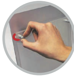
Carefully remove the upper fixings from the acrylic holder