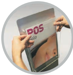
Slide your poster carefully between the acrylic sheets