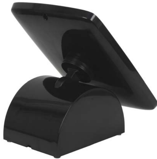
MoonBase tablet enclosure with iPad inserts and iPad face plate